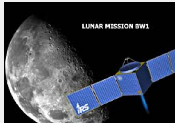
Newly developed by ElringKlinger; a solid PTFE-based fuel for the satellite thruster used on the Baden-Württemberg 1 lunar mission.