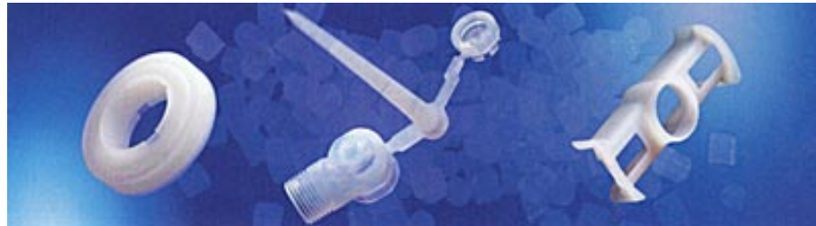
Injection-molded parts from Moldflon

The PTFE "Moldflon," which is suitable for thermoplastic processing, allows seals to be injection-molded. New degrees of freedom with regard to shaping enable complex assembly component geometries to be achieved. In the past, such geometries could only be manufactured by means of complex cutting or machining processes. In addition, the material offers benefits like improved cold flow and lower wear.